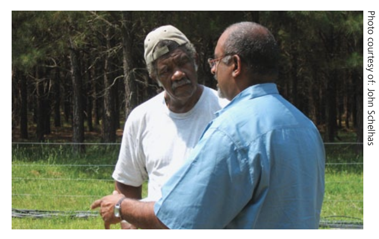
African Americans rely much more on social networks of family and friends for advice on forest management decisions then on professional consulting foresters or extension personnel.