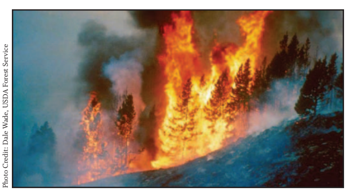
FIGURE 4. This high intensity crown fire exhibits long flames that are supported by and carried through the crowns of trees.

Light fuels include grasses, shrubs, and tree leaves or needles. They are referred to as light and flashy fuels