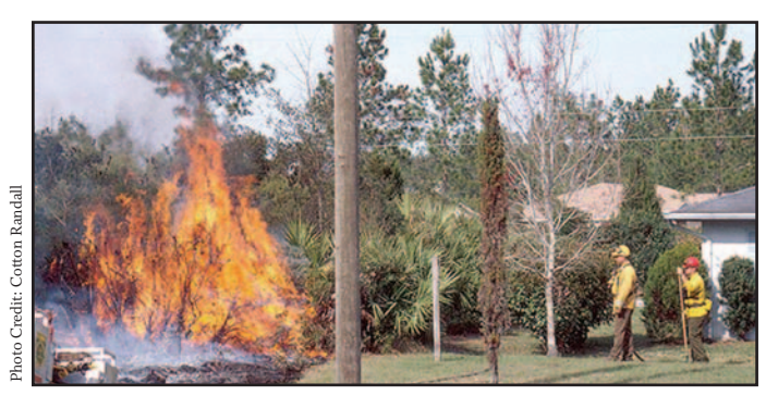
FIGURE 1. The vertical flames in this prescribed fire demonstrate the convective air currents carrying heat, smoke, and firebrands vertically into the sky. The smoke and firebrands can cause problems if they settle on roads or houses. In this picture, firefighters are standing between the fire and the house to detect the radiant heat being released and will hose the fire down if it gets too hot.

Radiation: Burning objects release energy in the form of heat. You feel radiant heat when you stand near burning logs in a fireplace. In general, the size of the burning object determines the amount of radiant heat released, with larger fuels burning hotter. In most cases, radiant heat from a wildfire will not ignite materials on homes at distances greater than 30 feet from the house. During prescribed fires in the wildland-urban interface, fire professionals carefully monitor the amount of radiant heat being released from the flaming fire front (Figure 1). Prescribed fires are set intentionally and strictly controlled to meet land management objectives.