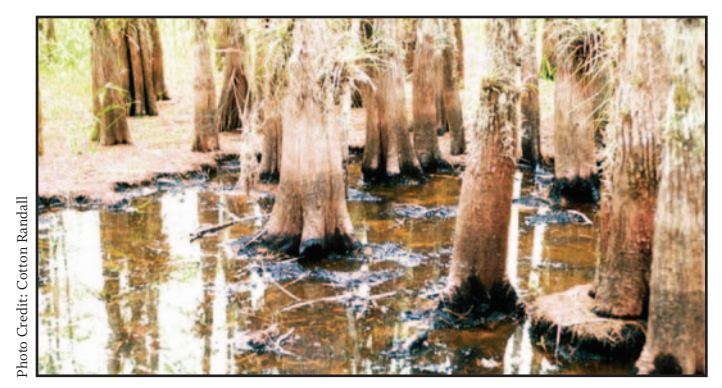
FIGURE 2. A ground fire burned the peat in a baldcypress swamp and created the hole that contains standing water in this photo.

Multiple factors interact to determine the behavior of wildland fires. Fire behavior refers to the intensity at which a fire burns and how it moves. General descriptions of wildfire behavior focus on where the fire occurs in the vegetation: underground, on the surface, and in tree crowns. Ground fires are fires that burn below the surface. In the South, muck fires are a type of ground fire where dead plant materials burn and smolder below the surface in dry wetlands (Figure 2). During surface fires, fuels at or near ground level, such as grass, shrubs, and/or fallen leaves and branches, carry the fire (Figure 3). Crown fires burn through the tops of trees (Figure 4). In general, the relative intensity (amount of heat released) of the different types of wildfire increases from ground to surface to crown fires. Firebrands may originate from surface fires or crown fires.